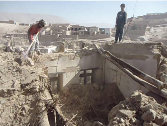
Credit: ACTED (27 October 2015) Destroyed homes in Qishlaq Bamba area of Pul-e-Khumri city, Baghlan province. Families whose homes were destroyed have taken shelter with relatives.