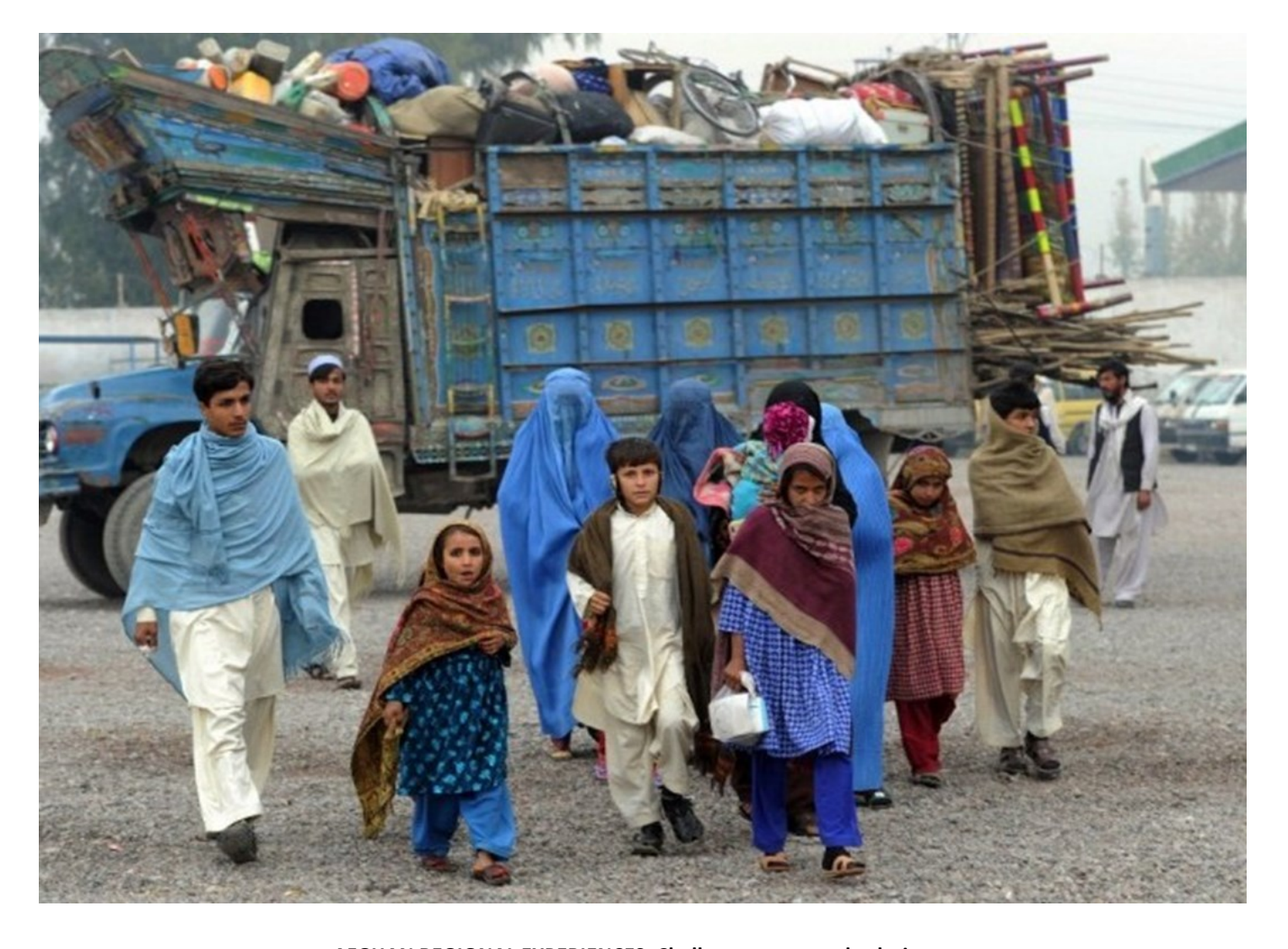
AFGHAN REGIONAL EXPERIENCES: Challenges, gaps and solutions

Between May and August 2014, ACBAR, the Norwegian Refugee Council (NRC) and the Danish Refugee Council (DRC) organized a joint series of regional workshops in East, West, North and Southwest Afghanistan. In total, 98 participants attended including staff members of NGOs, United Nations agencies, Civil Society Organizations, and the Department of Refugee and Repatriation (DoRR). The focus remained on 4 major sectors in need of humanitarian response and coordination: protection, shelter, NFI/FI, livelihood and food/nutrition.