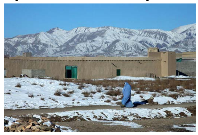
Twelve per cent of the total population is likely to be exposed to severe weather conditions.

temperatures, resulting in the likelihood of a relatively mild winter ahead. Even so, early and heavy snowfall has already impeded access to at least 13 districts in Northern provinces, including ten in Badakhshan. As winter progresses, other districts across Afghanistan will become hard to access or completely cut off, due to heavy snowfall and the impact of winter rains on already very poor roads. This