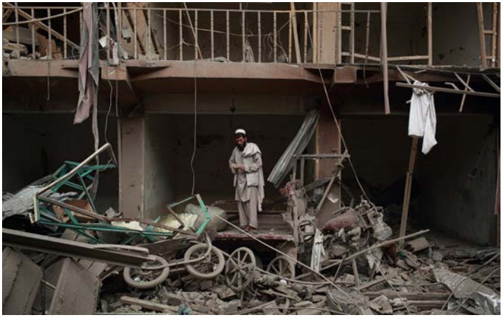
According to SAVE, insecurity not only affects how aid is provided, but also what type of aid is delivered.

Years of escalating insecurity in Afghanistan have had a debilitating effect on humanitarian operations. High levels of insecurity in any conflict-affected country, Afghanistan included, change the way aid agencies operate in a