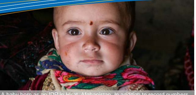
A baby born as an IDP in Hirat, Afghanistan. In addition to record numbers of IDPs, more and more Afghan families are living in prolonged displacement.

Source: http://fts.unocha.org More on funding on page 8.