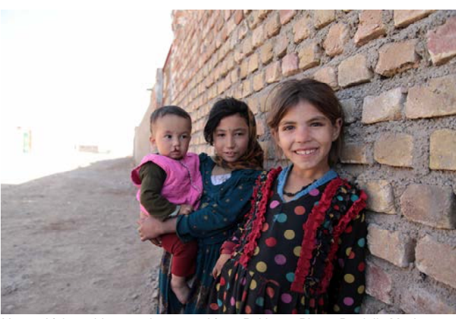
Young Afghan girls recently returned from Pakistan.

Under the leadership of the Humanitarian Coordinator, the Afghanistan Common Humanitarian Fund (CHF) has reached its 2016 funding target of 15 per cent of the