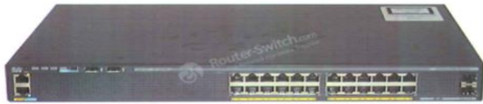
Table 1 shows the Quick Spec of the Cisco 2960X-24TS-LL switch.