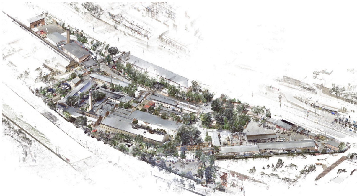
3D Scan of the PROJECT site