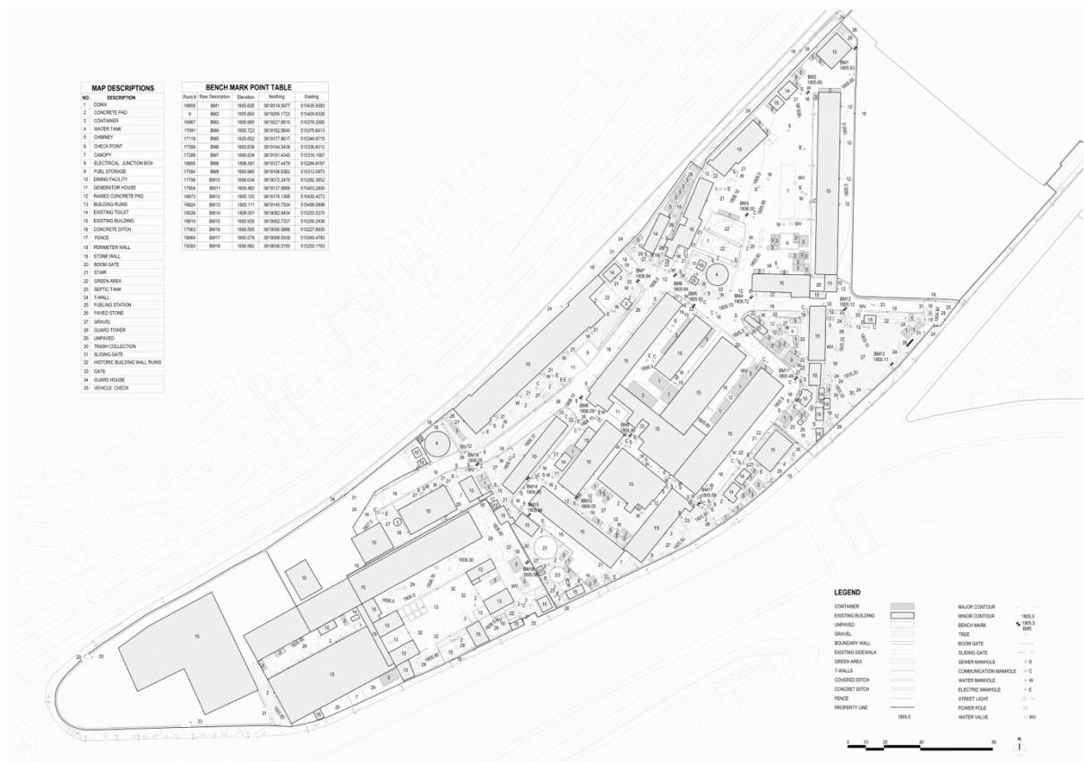
Survey of the PROJECT site