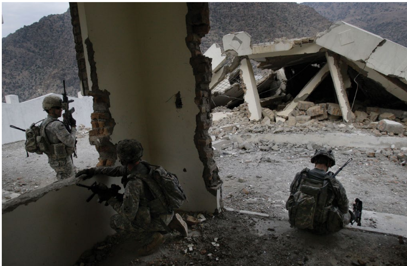
US soldiers wait inside a destroyed health clinic in the Pech Valley of Afghanistan's Kunar Province in November 2009. The US-funded health clinic was bombed by Taliban fighters earlier in the year.

In regulating civilian access to health care, the Taliban applied less scrutiny than in education. Unlike education, the Taliban do not see the traditional health sector as posing a political, military, or ideological threat, and thus harbor less underlying distrust for it. When consulted, religious scholars reportedly could find no grounds in Islam for interfering with it. The generally positive Taliban attitude toward health interventions has allowed the government and aid agencies comparably greater access than in other sectors.