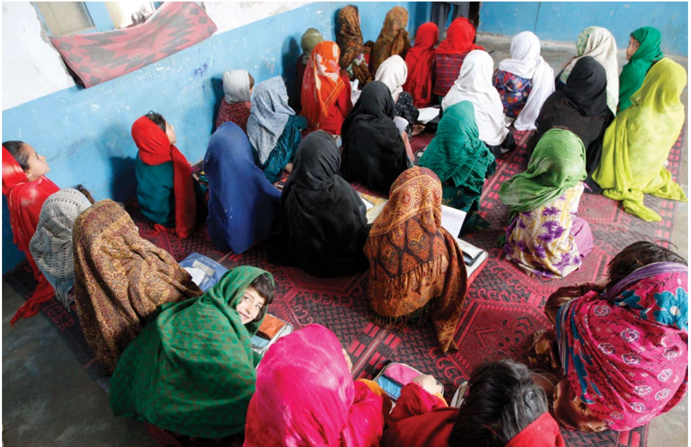
Afghan girls attend a lesson at a school in Sarkani district, in eastern Afghanistan's Kunar Province, in February 2009.

Attacks on schools appear to increase substantially around 2006–7 in line with a marked upsurge in Taliban violence overall. 27 Girls' schools were targeted more frequently than boys'. 28 Female education is generally more controversial than male education, and thus attacks on girls' schools might have been more likely to be tolerated by civilians. Targeting education was also a far lower priority for the Taliban in the beginning, especially in the east and southeast, than international and Afghan forces. Education, however, may have been a more achievable, second-best target. Schools would have been the only government presence in more remote villages, making them convenient objects of Taliban violence aimed at diminishing state presence. 29