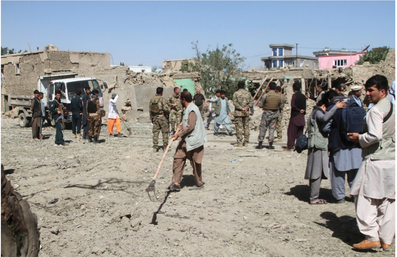
Afghan security forces inspect the site of a car bomb attack in Ghazni Province on July 7, 2019. According to Afghan government officials, the bomb killed a few people and wounded dozens of others, many of them students attending a nearby school.

population. The statement on the 2011 spring offensive, for example, instructed fighters that “strict attention must be paid to the protection and safety of civilians during the spring operations by working out a meticulous military plan.” 59 In 2016, an Eid statement instructed fighters to “prevent civilian casualties, maintain justice and win hearts and minds of people; instruct them from time to time about people’s rights and dignity.” 60