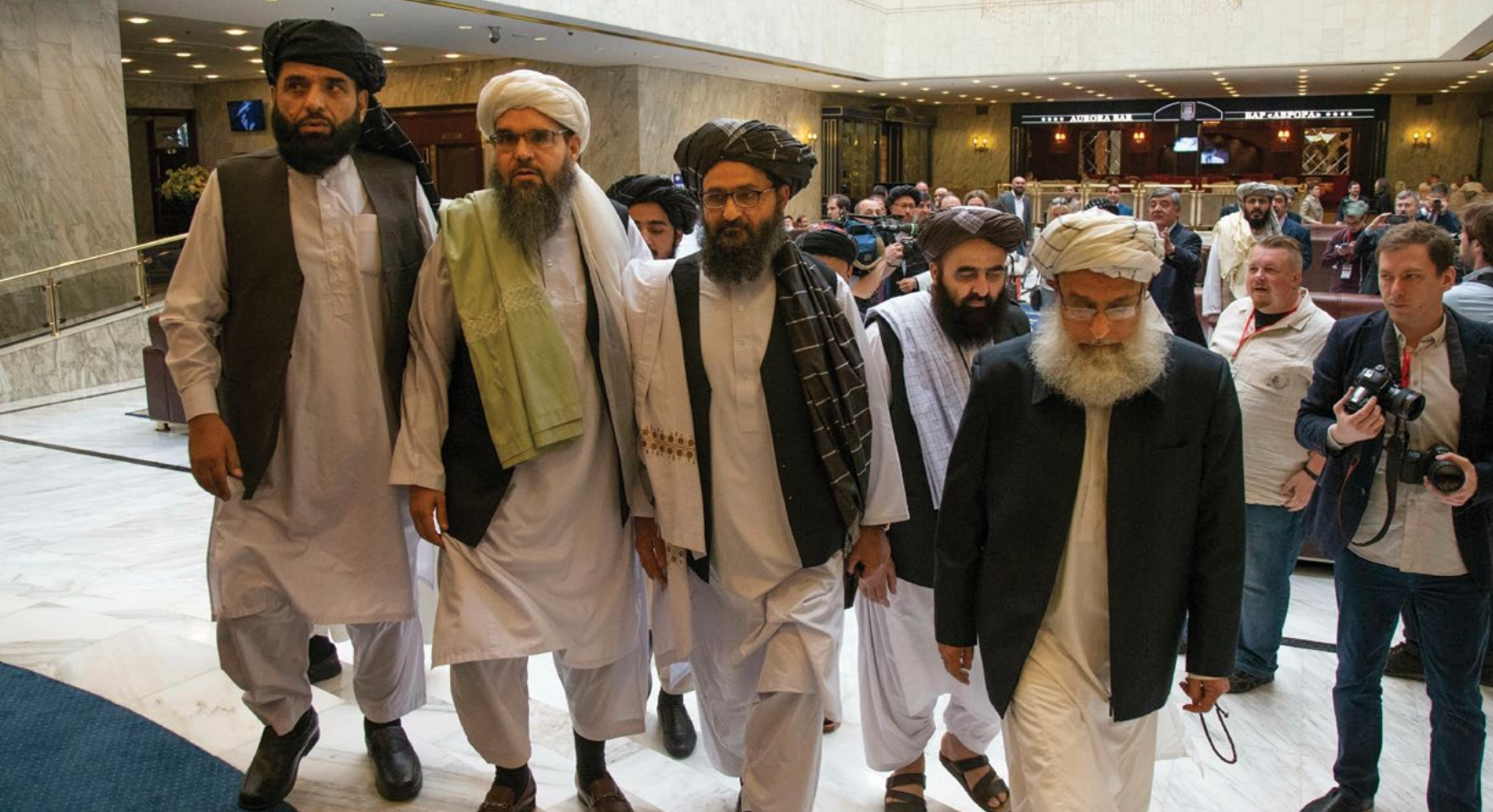
Members of the Taliban delegation arrive for talks in Moscow on May 28, 2019. Among them is Mullah Abdul Ghani Baradar (third from left), who co-founded the Taliban movement in Afghanistan.