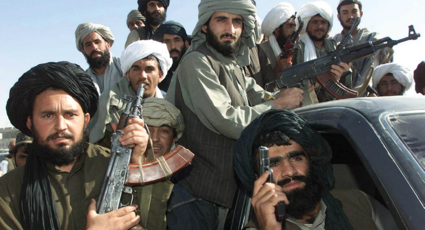
Taliban fighters pose with their weapons in the main bazaar of Kandahar city on November 2, 2001, shortly after the US invasion the previous month.