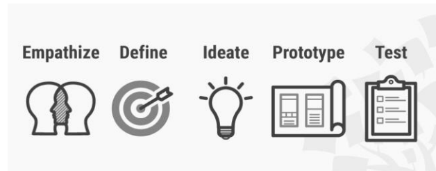
Figure 1. The figure illustrates the design thinking framework

Due to the iterative and R&D focused nature of the Project, WHH seeks a service provider from the private sector that has the required capacity and interest in intensively engaging and working alongside WHH's Product Development Team in all three phases of research / immersion, ideation and testing during the anticipated two (2) year contract period.