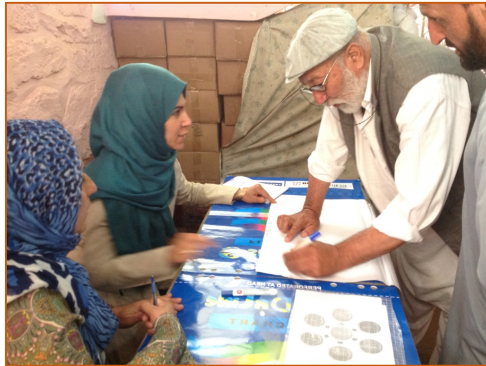
Figure 1: Tashabos Teachers During Group Work