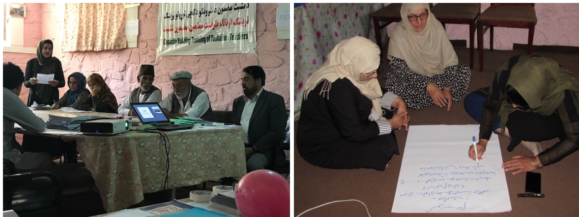
Figure 3: Training Session and Group Work in Progress