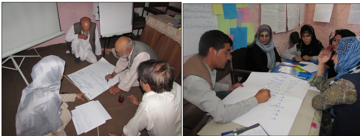
Figure 8: Groupwork sessions