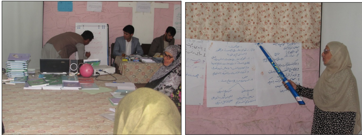
Figure 7: Microteaching sessions