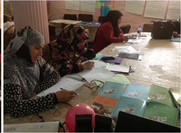
Figure 11: Tashabos Teachers' Training in Progress