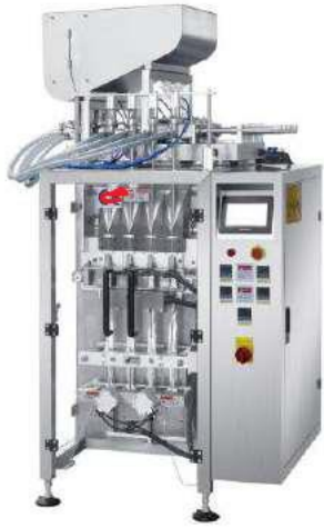
Extra Stirring device in tank Extra Temperature heating