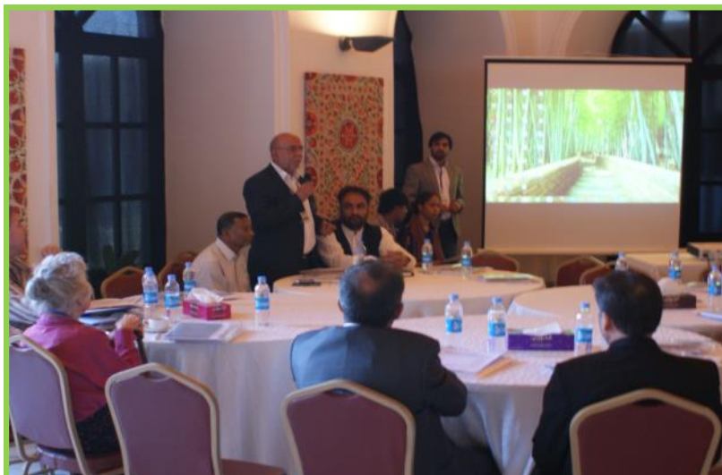
Welcoming to the Afghanistan National Consultation by ACBAR's Chairperson

As with other humanitarian organizations, ARCS face difficulties in terms of limited resources, coordination of timely responses to help affected communities, and access to affected communities due to geographical challenges and ongoing conflict within the country.