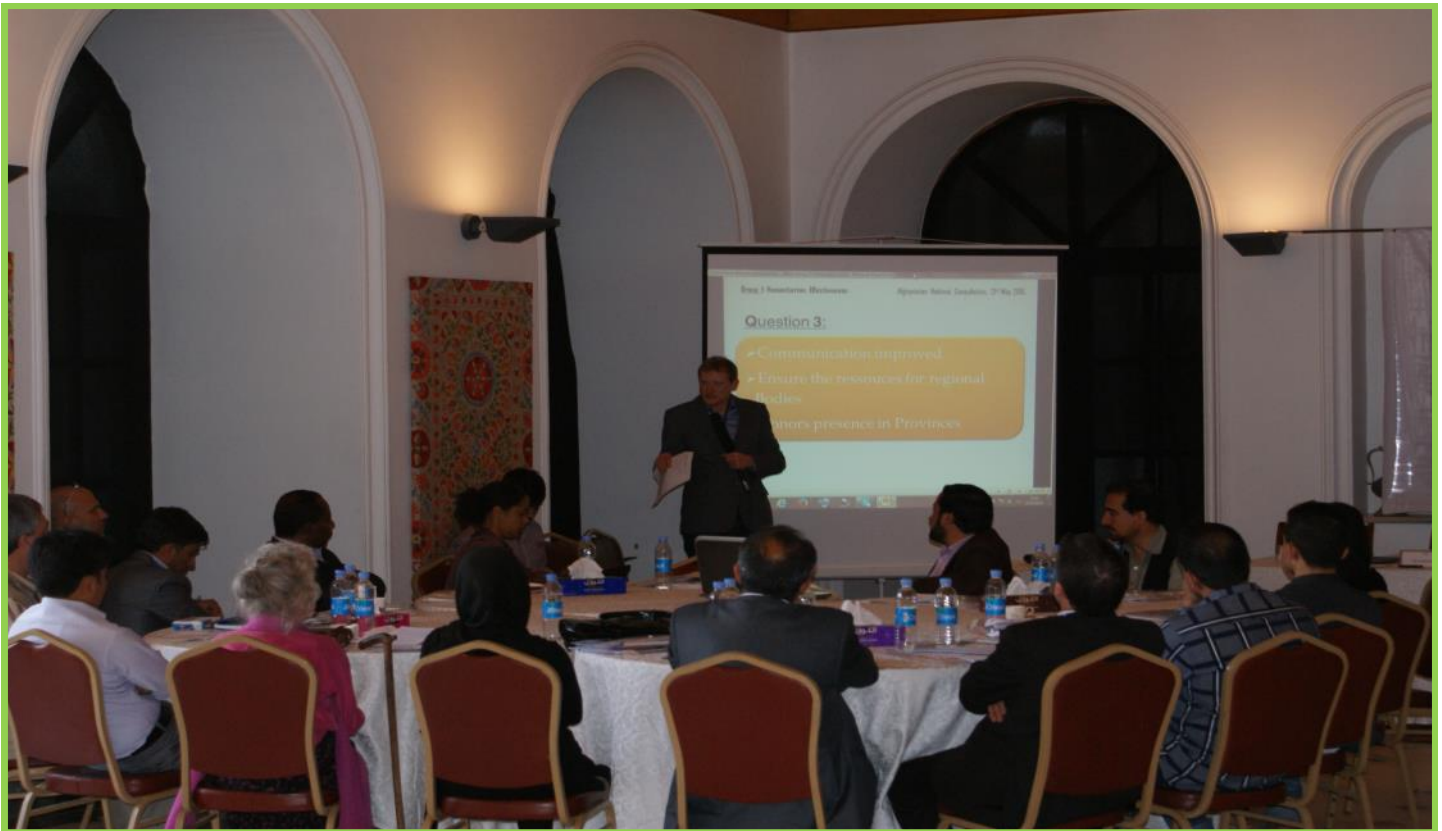
Group 1 discussion on humanitarian effectiveness during the Afghanistan National Consultation