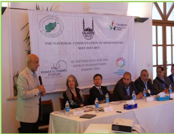
Special guest speakers

The World Humanitarian Summit (WHS) is an initiative of UN Secretary-General Ban Ki-moon, managed by UN OCHA. It will be held in Istanbul on 26th and 27th May 2016 and will bring together governments, humanitarian organizations, people affected by humanitarian crises and new partners including the private sector to propose solutions keep humanitarian aid fit for purpose. During the two year process leading up to the WHS, various channels of consultations, will offer a platform for humanitarian actors to highlight what they consider crucial to better address the needs of affected populations .