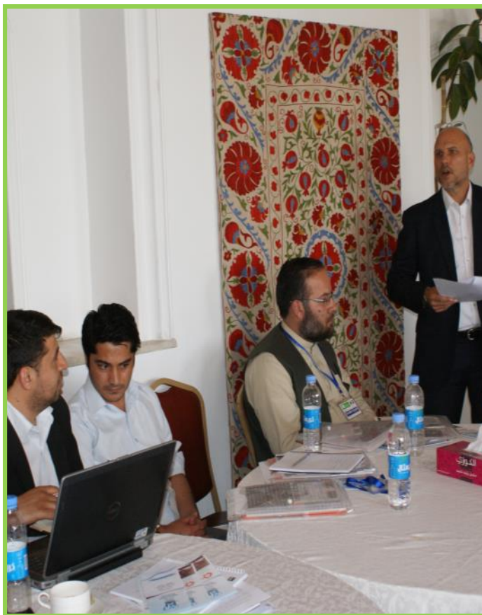
Group 2 discussions on reducing vulnerability and managing risk