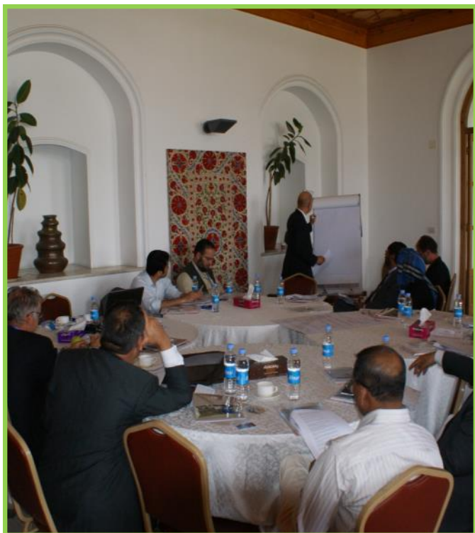
Group 2 discussions on reducing vulnerability and managing risk