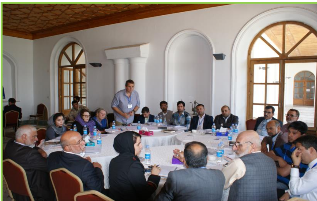
Group 3 discussions on transformation through innovation