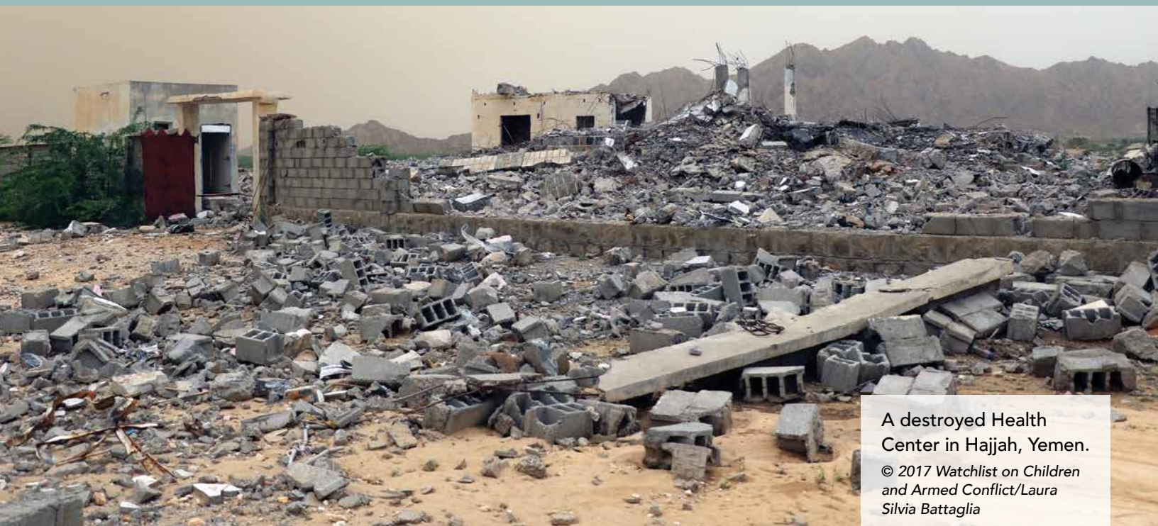
A destroyed Health Center in Hajjah, Yemen.