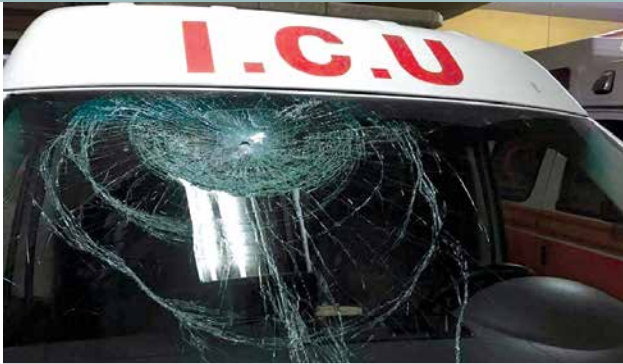
Palestinian ambulance windshield damaged by Israeli security forces' shooting.