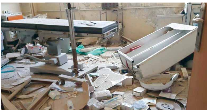
Aftermath of an attack on a SAMS-supported facility in Aleppo, Syria, November 2016.