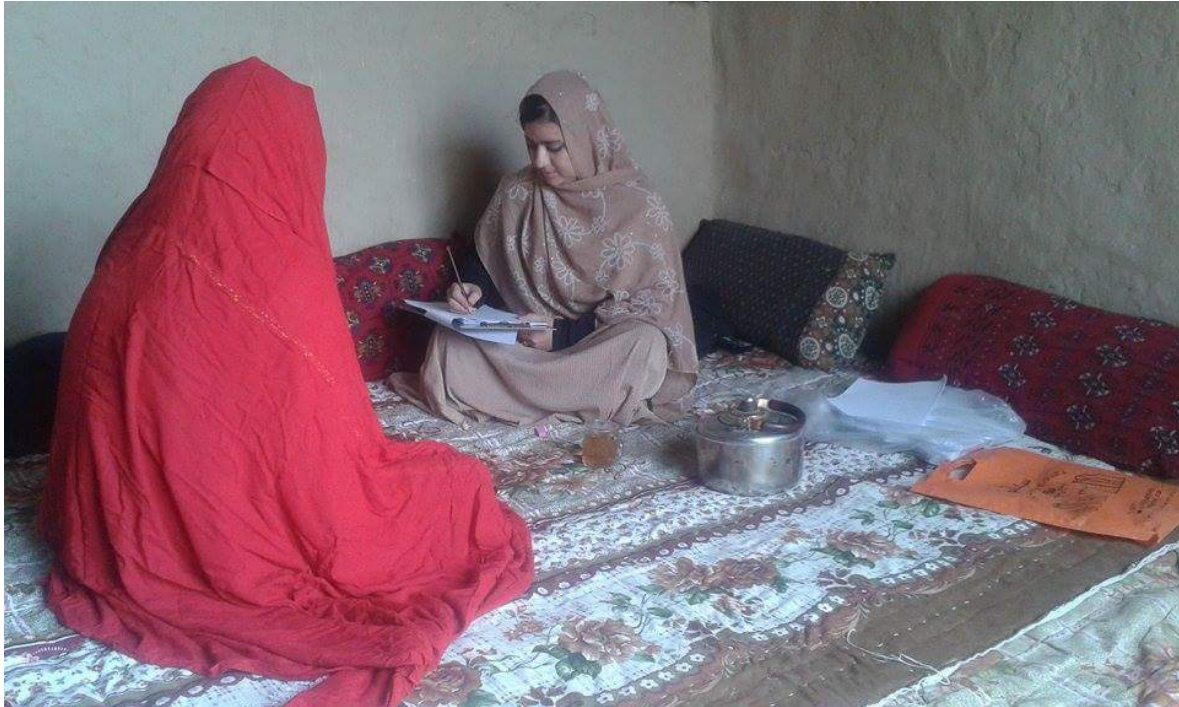
Featuring in large part female characters, and dealing with issues that are very relevant and important to womenfolk, Da Pulay Poray drama is highly popular among female listeners, who featured equally, along with men, in the research

Although the audience research was questionnaire-based, hence quantitative in nature, one option with each question enabled respondents to elaborate on answers they had given, or to give another answer. This option gave the audience research a qualitative element, in addition to the substantive qualitative nature of the research.