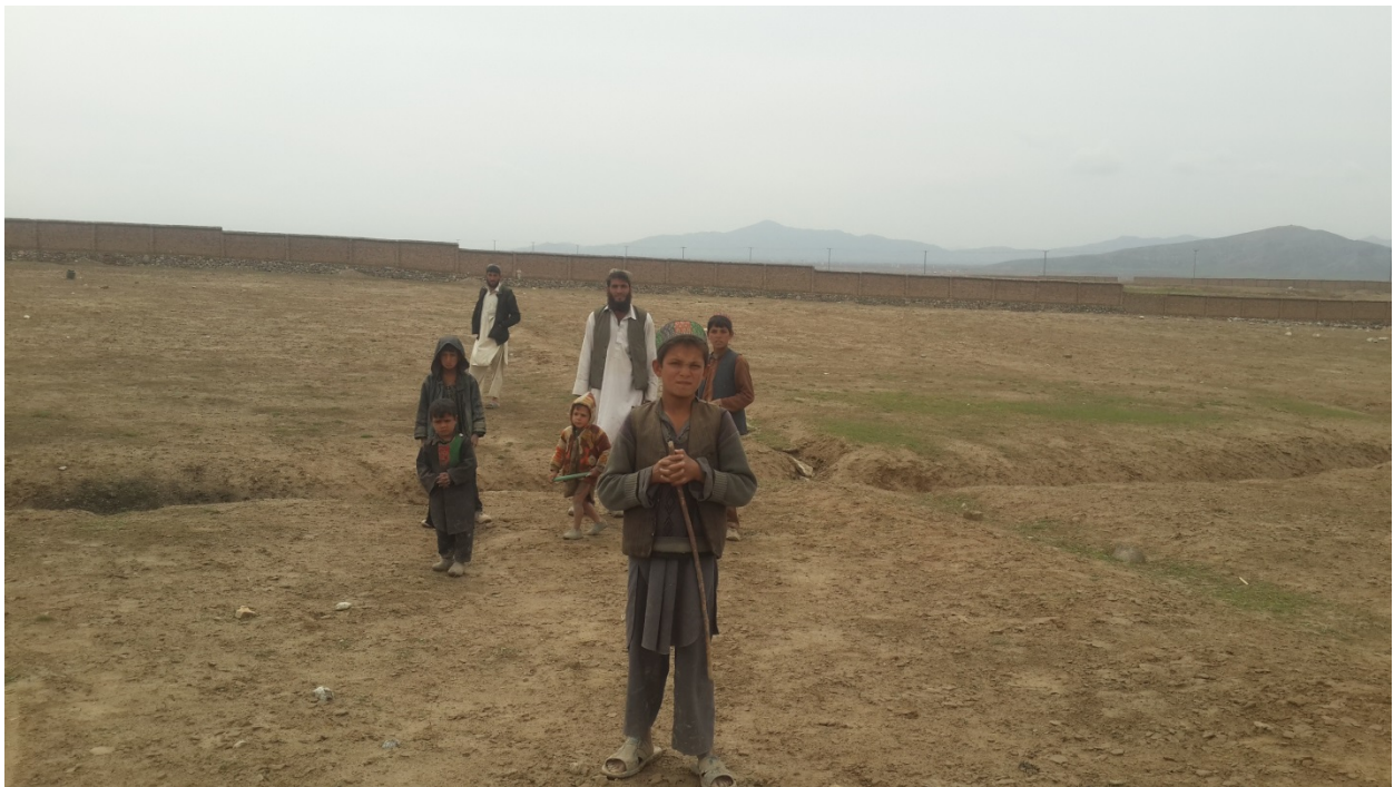
It is normal for whole families – like this kochi family in Deh Sabz near Kabul – to listen to Da Pulay Poray drama

Indeed, the next question dealt with this point: why Zafar Khan had run away from the hospital, before his treatment had been completed? As with other questions, three options were given, one of which was correct, while the others were not in line with Da Pulay Poray storyline. The three options given were as follows: