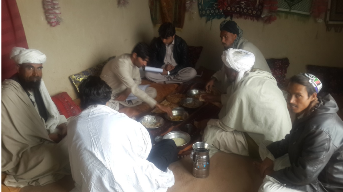
Local people were most pleased to see an audience research team from Da Pulay Poray drama, one of their favourite radio programmes, and offered the research team heartfelt hospitality

Da Pulay Poray drama, along with its sister programme Da Pulay Poray programme is broadcast on three radio stations. The main broadcaster of Da Pulay Poray is Arakozia FM, part of the Moby Media Group that oversees Tolo TV – the main TV station in Afghanistan. The broadcast of Da Pulay Poray from Arakozia, which reaches all southern and eastern provinces of Afghanistan, in a south-westerly to north-easterly arc that stretches from Helmand to Kunar, is augmented in eastern Nangarhar by Spin Ghar radio, and by Spogmai radio in Kabul. Arakozia does not broadcast in Kabul, while in eastern Nangarhar their transmitter has been damaged, hence our recourse to Spogmai and Spin Ghar in those areas. However, in the two districts selected for the research – Kama and Surkh Rud – Arakozia has full coverage. All those interviewed in Kabul were listening to Da Pulay Poray from Spogmai radio.