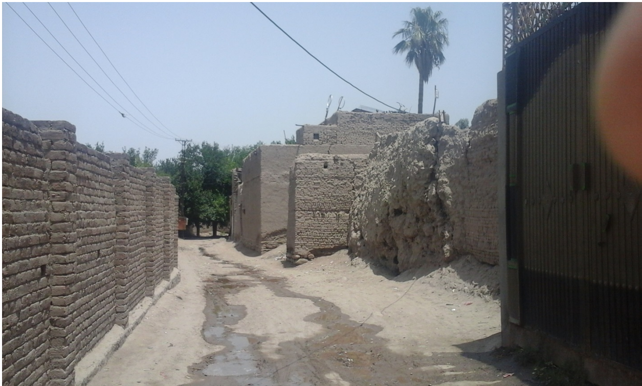
A typical cluster. This cluster is in Surkh Rud, Nang