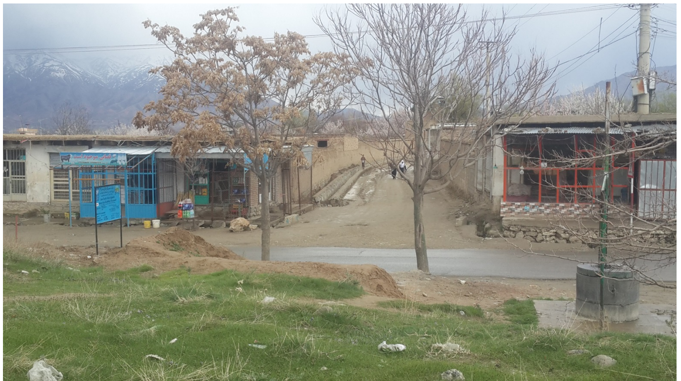
Central areas in Paghman, one of the areas where the research was conducted

For the audience research , two districts were chosen in Nangarhar district, and two in Kabul district. The districts were chosen with several factors in mind: security, coverage of the radio stations broadcasting Da Pulay Poray drama and in Kabul a majority of Pashto speakers being present in the districts covered in the research. With this in mind, two districts were chosen in Kabul province and two in Nangarhar. The two districts chosen in Kabul were Deh Sabz and Paghman. Deh Sabz lies in the eastern part of the Kabul plateau, while Paghman is a mountainous region to the north-west of Kabul. In Kabul, Da Pulay Poray researchers went to the agricultural district of Kama, at the confluence of the Kunar and Kabul rivers, and Surkh Rud, to the west of Jalalabad city.