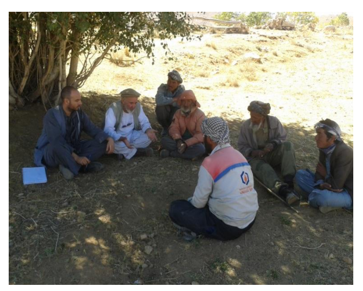
Focus group in Sya Khâk, Surkh Abad area

We decided not to be trapped in a specific or minimum number of people to interview. It has happened many times that we interviewed one or two people only, to enjoy an unasked discussion. It was particularly the case in small villages or when we met with acquaintances (for instance some of the para-vets supported by MADERA). However, in villages or bazaars, we tried to gather many people to have interesting focus groups.