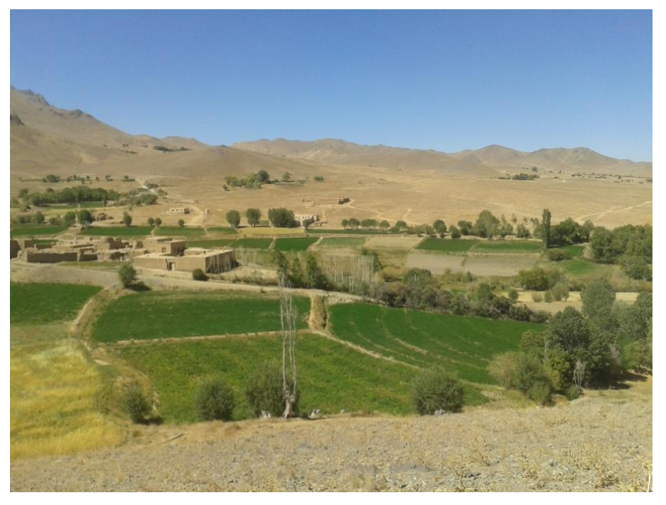
Manteqa of Sorkh Abad