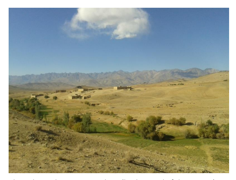
The Koh-e-Baba Mountain chain (background of the picture) is a natural separation between Behsud and the largest part of Hazârajat

Wardak province<sup>10</sup> is located on the southern side of Koh-e-Baba mountain chain (5,060m) and west of Paghman mountain chain (4,970m). From north to south, altitude decreases from 3,500 (average altitude of piedmonts) to 1,200 meters in Jighatu area. It is surrounded by Bamyan (north-east), Parwan (east), Kaboul (south-east), Logar (south) and Ghazni (southwest) provinces.