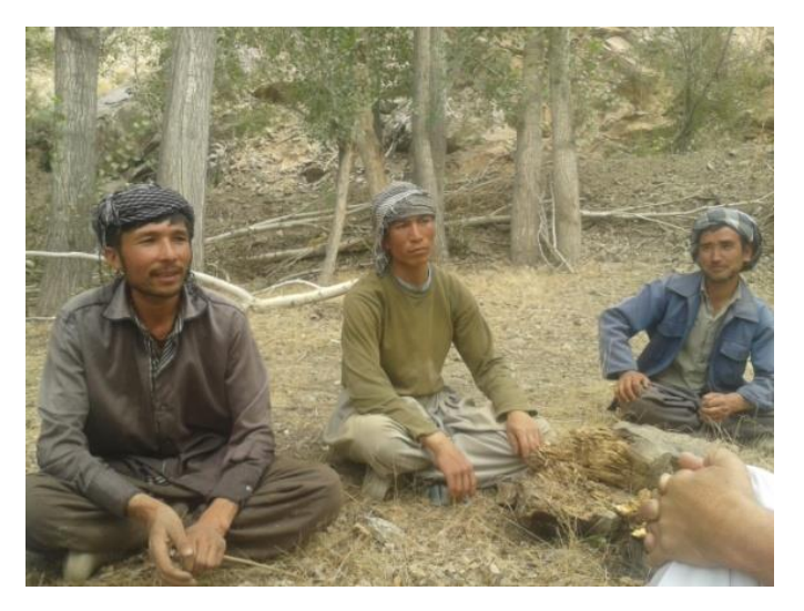
Young men of Sar-e-Tala building a barrage in CHP project. They do not have land. Landowners do not use them as farmers as familial plots are very small in the area; they all think about leaving the area after completing their job

However, it seems that it still partially remains in the most remote areas, in Sorkh Abad (even if as residual), Koh-e-Biroon, on the mountain top of Dahan-e-Rishqa area, in remote villages of Sang-e-Shanda.