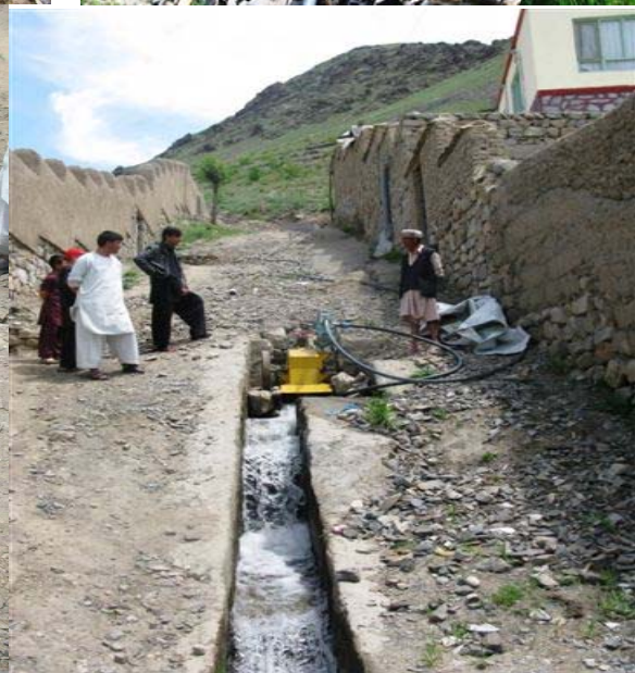
Hydro-powered Water Pump at pumping station below the irrigation channel

The device has a very simple operation and maintenance system. It requires cleaning and checking nut bolts and greasing bearings at few days interval. Secondly, it requires replacing the springs and washers of the pump every few weeks. The spare parts i.e. nut bolts, bearings, springs, washers and belts etc are easily available from local hardware shops at cheaper rates in Pakistan.