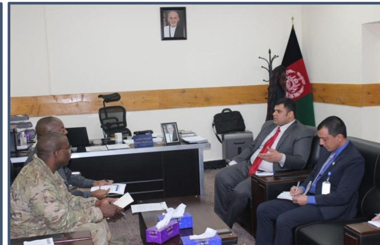
NPA officials meeting with Resolute Support representatives