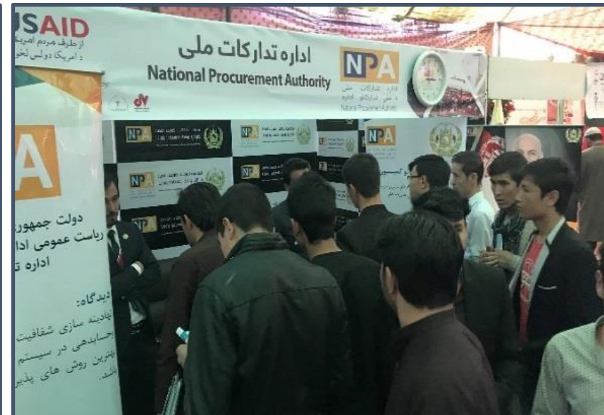
NPA's booth in one of the exhibitions in Kabul