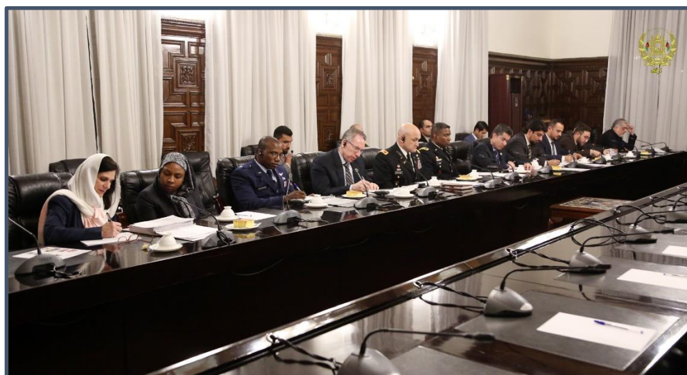
International observers (SIGAR & CSTCA) at NPC sessions