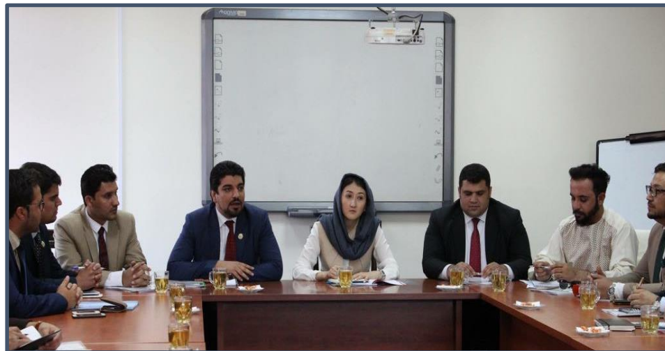
NPA and IARCSC officials meeting with government spokesperson about mass recruitment.

The cadre department continued working on standardizing the procurement structures of PEs. It is worth mentioning that cadre department in coordination with Department of State Affairs and Administration of the General Directorate of Administrative Office of the President of the IRA and IARCSC in close collaboration with the respective PEs has standardized the organizational structures of 52 PEs so far, which were then approved by the relevant authorities. Similarly, the TORs for 52 PEs were prepared in coordination with the above mentioned authorities. The organizational structures and TORs for the remaining PEs are currently under process.