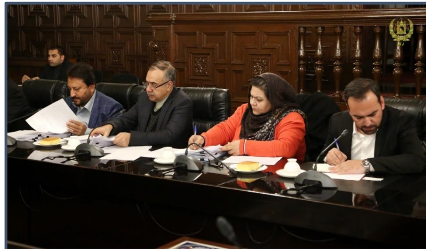
The representatives of civil society and parliament members are observing the NPC session