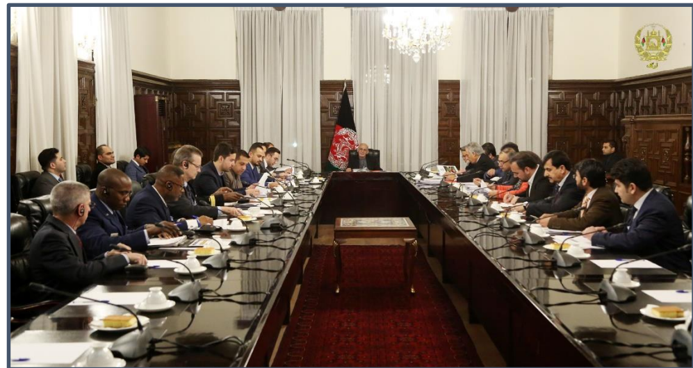
138 session of the National Procurement Commission