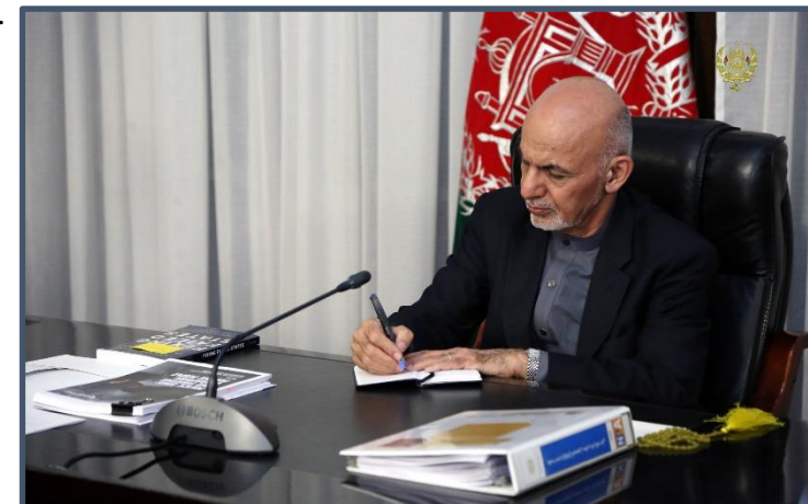
H.E. Mohamad Ashraf Ghani the President of Afghanistan in NPC session