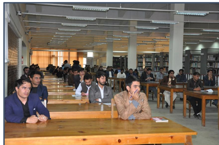
The shortlisted candidates are waiting for procurement exams in Kabul University.