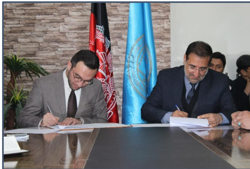
NPA signed MoU with Kabul Polytechnic University

In FY 2017 the SCID has worked in the field of Vulnerability and Capacity Assessment(VCA) of the procurement law and procedures from corruption perspective, Institutionalizing the Culture of Professional Behavior and code of conduct in the procurement atmosphere, addressing comments and feedbacks (Hotline Mechanism), strengthening the strategic communications, promoting the rule of law by establishing of an internal compliance mechanisms, reflecting the report of the NPC, monitoring the publication of reports, news and discussions on procurement reform and system in the mass media, accountability and responsiveness, raising public awareness on procurement reforms, taking part and active participation in exhibitions, installing of the bulletin boards in procurement entities, are some other impressive activities of SCID.