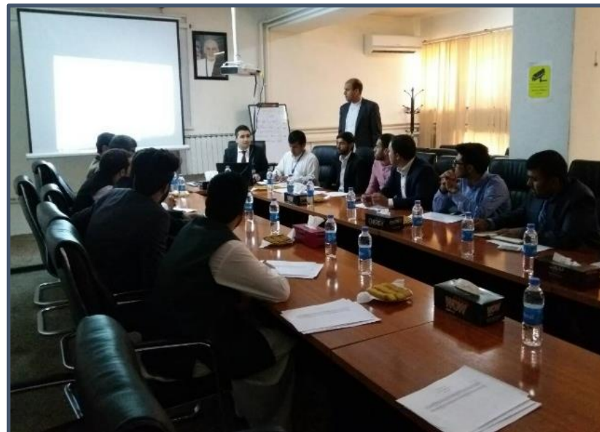
Bid opening process in NPA's office