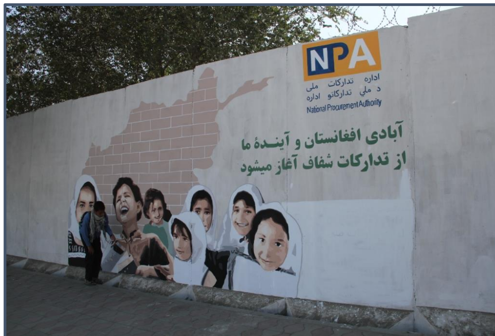
The future development of Afghanistan depends on transparent procurement.