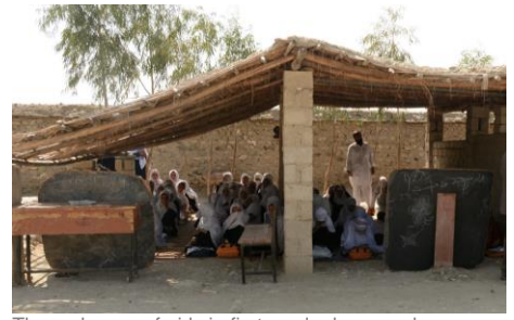
Three classes of girls in first grader learn under a sun roof in the school yard of Hejratabad High School.

More than 2,000 girls and boys go to school in two shifts. The older students sit at wooden desks in the school building built by the residents but there is no space for the first graders inside.