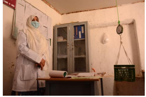
Malnutrition screening and treatment are integrated into the health centre.

The basic health centre is in substandard condition, lacks access to safe drinking water and has