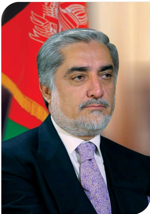
Dr. Abdullah Abdullah

Chief Executive of the Islamic Republic of Afghanistan