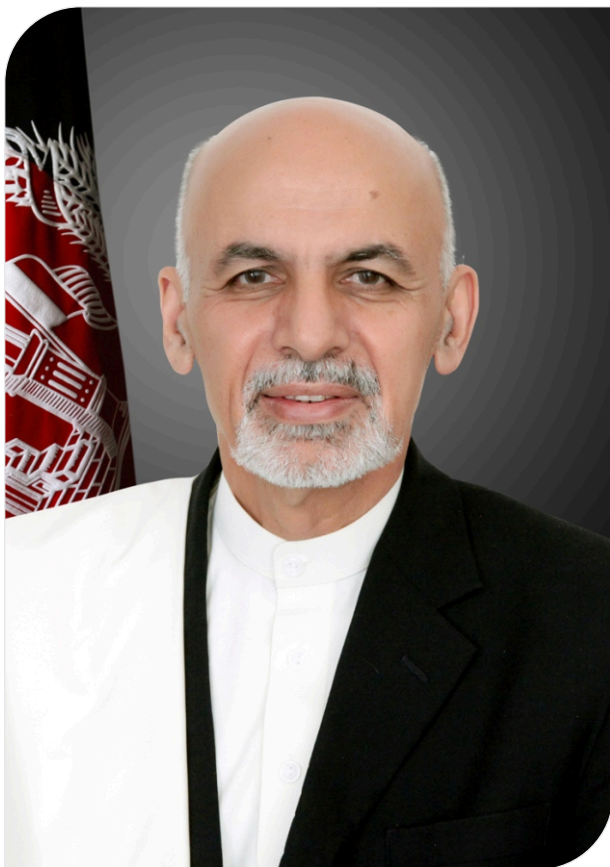
Muhammad Ashraf Ghani President of Islamic Republic of Afghanistan