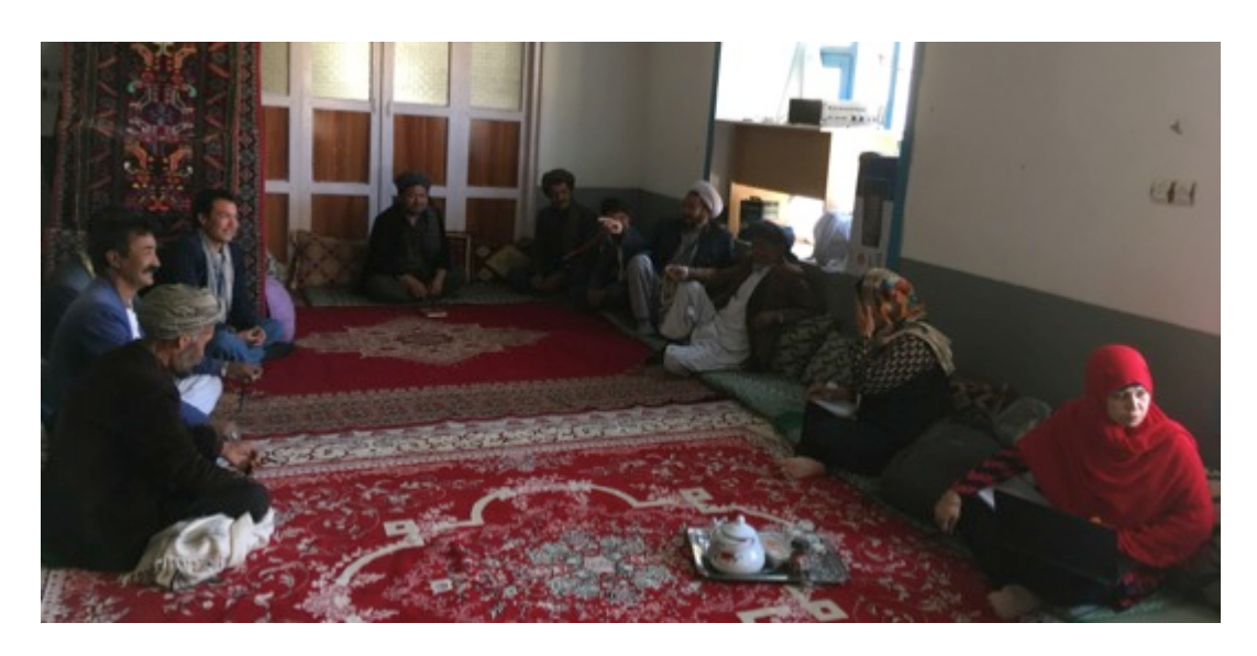
Male FGDs Panjab District, Bamyan Province, 1 July 2018

Members of the Male litema have been playing an important role in community response to VAW. Most of the members of the Male-litema are also members of the CDCs in all six locations visited in the context of this study, where they have been dealing with issues related to the community, including cases of VAW.