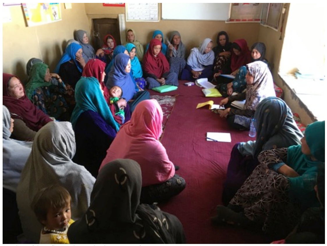
Members of the Reflect Circles in Yakawlang District of Bamyan Province