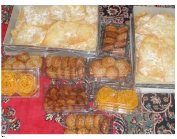
ookies baked by women survivors of violence, supported through Small Grants in Herat Province

Women in Injil and Guzara learning production of jams and pickles depending on their own interest or potential for profit. Women who learned baking were able to bake different kinds of cookies, cakes and other sweets and confectionaries, and to sell them in local market or within their villages. Most women who were part of the baking initiative reported that they had very busy days before Eid and they produced a lot of cookies, cakes, doughnuts and other Afghan traditional sweets and managed to make a good profit.