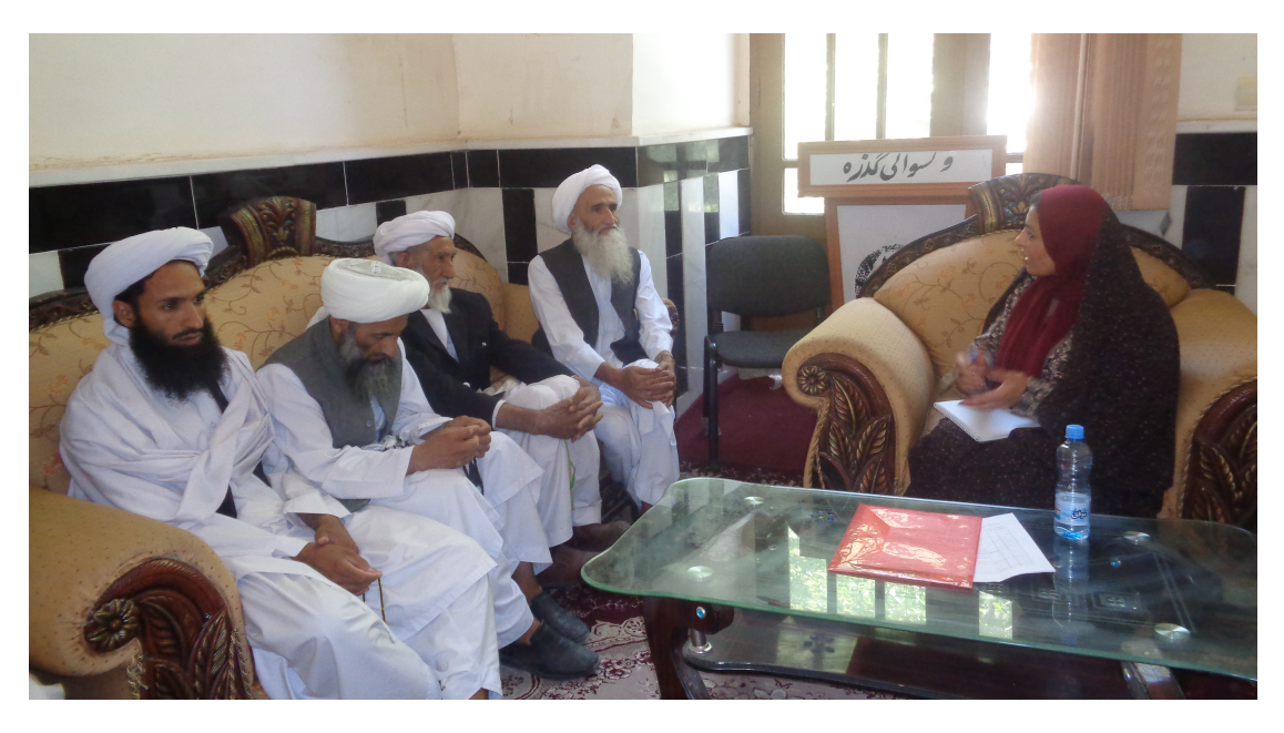
Meeting with Ulema in Guzara District, Herat Province.

One of the positive differences that the Mohammadi village in Guzara District has in comparison with other much less tolerant villages is the fact that Hazara, most of who are returnees from Iran, largely populates its five townships. In this village access to education is encouraged by the community and traditionally Hazaras are more open minded in regards to respecting and adopting of human rights values compared to other communities who do not place the same value on education or live in more conflict-affected areas.