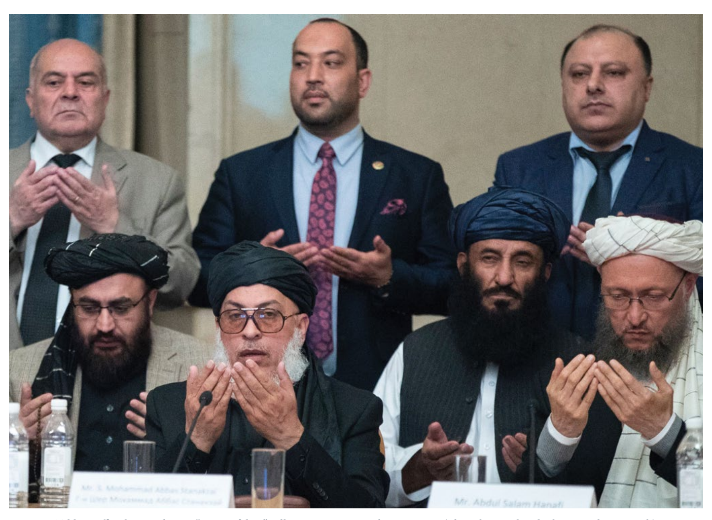
Taliban officials pray during "intra-Afghan" talks in Moscow in February 2019.

think about what to do next. But until then, we have to finish the war." A Helmand district commander took a similar line: "If the US stops their support to the government for even a month, we would be able to take all of Afghanistan, and that's why we have to reach an agreement with the US."