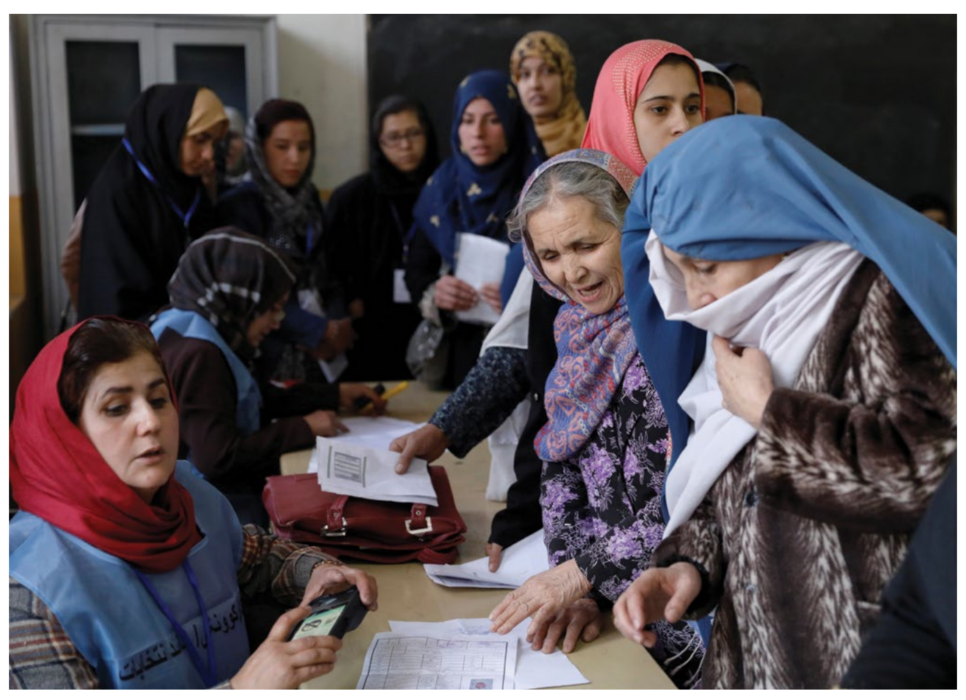
Afghan women line up at a polling station during parliamentary elections in Kabul in October 2018.

have access to the media have to raise their voice about these issues. . . . Women in this rural area are not able to do anything, but the women living in the cities have to raise their voice." As this fieldwork and other research like it have indicated, the rural-urban divide regarding women's roles is vast, and restrictions on women are most extreme in places like Helmand. This is not to suggest, as media debates around peace talks occasionally imply, that women in these areas do not have social power or conceive of themselves as not having rights. Instead, many of these women genuinely wanted to see their rights restored or respected.