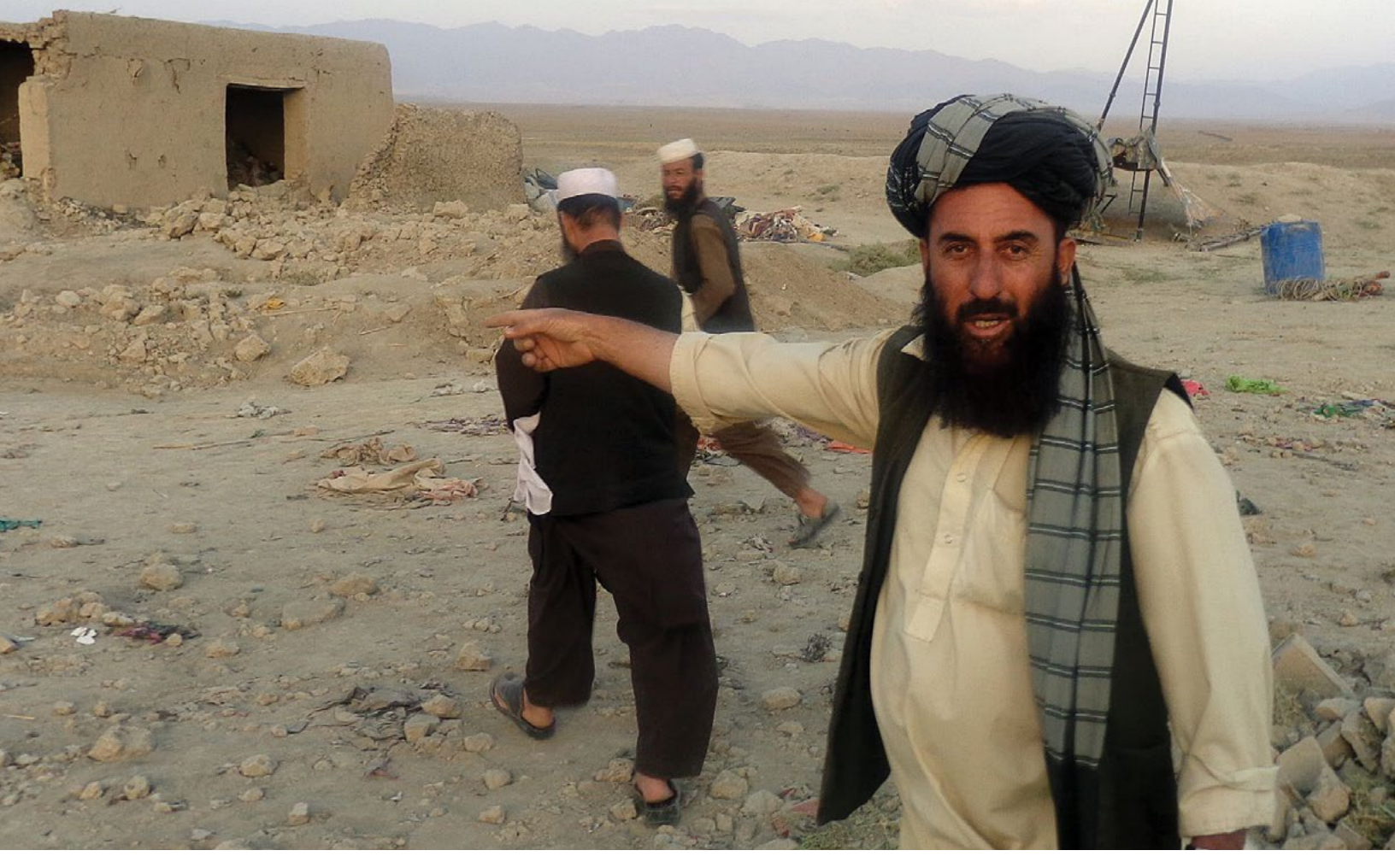
A resident of Pul-e Alam points to damage to a home following coalition airstrikes supporting an Afghan security forces operation in August 2017.