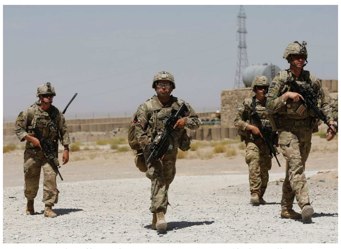
US troops patrol at an Afghan National Army Base in Logar Province in August 2018.

also were scarce. Many described repeated damage to or destruction of their livestock and agricultural holdings. There was little aid and few private-sector actors that were willing to invest in these areas. People in Helmand in particular mentioned that they had been compelled to feed and shelter Taliban members even when they had little to feed their own families.