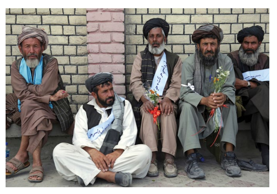
Members of the Helmand Peace Convoy rest in Kabul after marching more than three hundred miles from Lashkar Gah to protest the war.