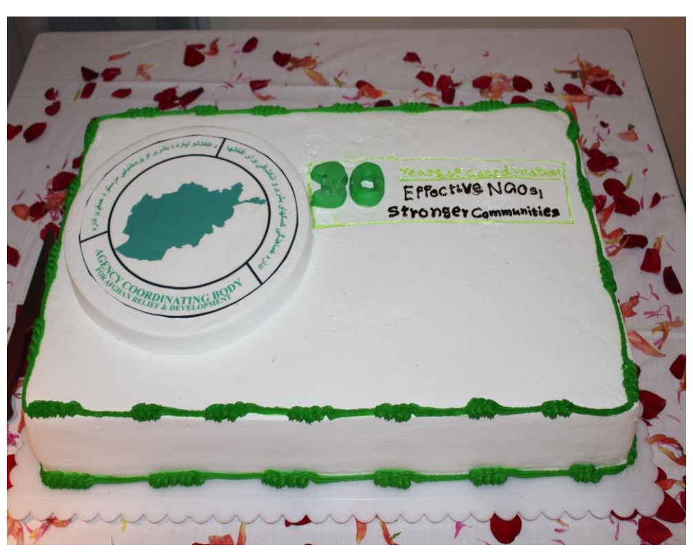
30 Years of Coordination