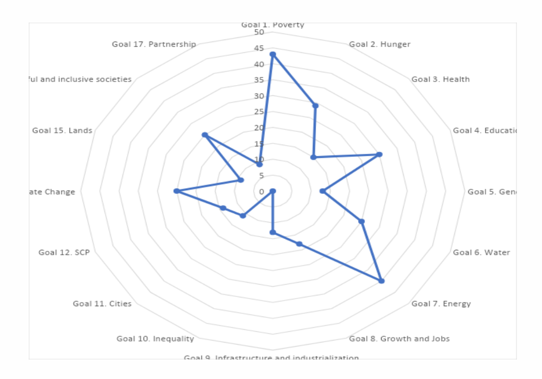
Figure 1. Source: Aligning National Priority Programs (NPPs) with Afghanistan Sustainable Development Goals (A-SDGs), Ministry of Economy

According to MoEc, ministry is almost halfway through with the alignment of the A-SDG targets for which they have prepared a draft concept-note for financing the SDGs. He notes that the current in