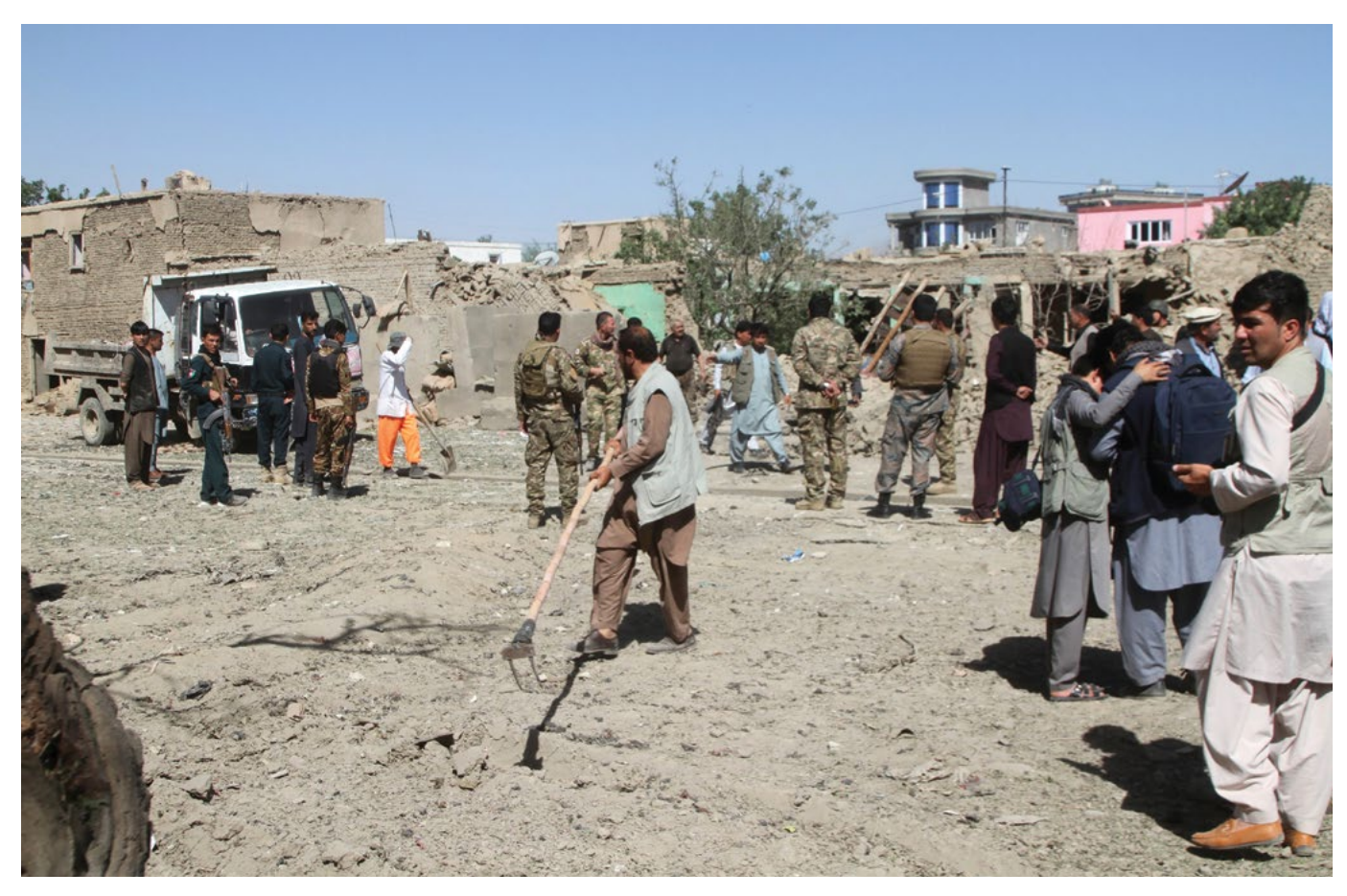
Afghan security forces inspect the site of a car bomb attack in Ghazni Province on July 7, 2019. According to Afghan government officials, the bomb killed a few people and wounded dozens of others, many of them students attending a nearby school.

population. The statement on the 2011 spring offensive, for example, instructed fighters that "strict attention must be paid to the protection and safety of civilians during the spring operations by working out a meticulous military plan." In 2016, an Eid statement instructed fighters to "prevent civilian casualties, maintain justice and win hearts and minds of people; instruct them from time to time about people's rights and dignity." 60