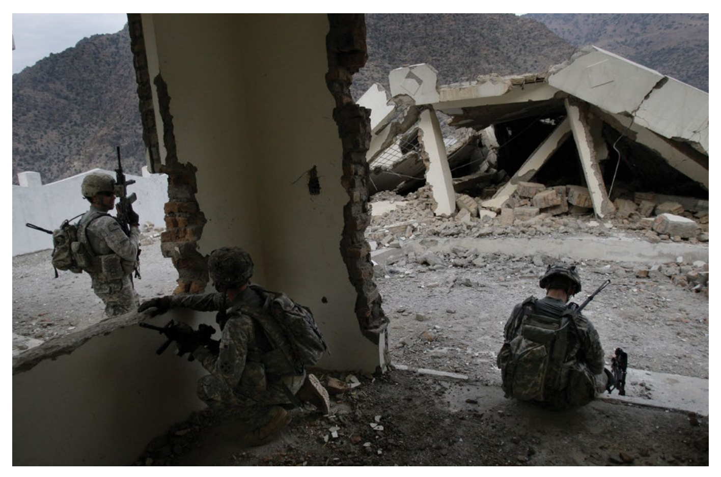
US soldiers wait inside a destroyed health clinic in the Pech Valley of Afghanistan's Kunar Province in November 2009. The US-funded health clinic was bombed by Taliban fighters earlier in the year.

In regulating civilian access to health care, the Taliban applied less scrutiny than in education. Unlike education, the Taliban do not see the traditional health sector as posing a political, military, or ideological threat, and thus harbor less underlying distrust for it. When consulted, religious scholars reportedly could find no grounds in Islam for interfering with it. The generally positive Taliban attitude toward health interventions has allowed the government and aid agencies comparably greater access than in other sectors.