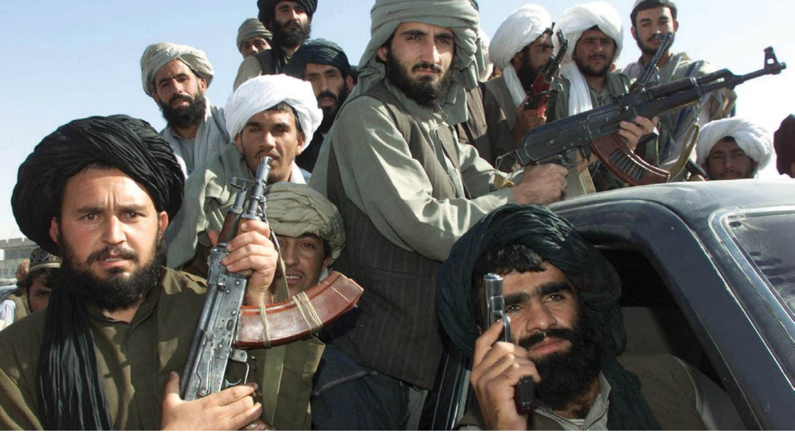
Taliban fighters pose with their weapons in the main bazaar of Kandahar city on November 2, 2001, shortly after the US invasion the previous month.