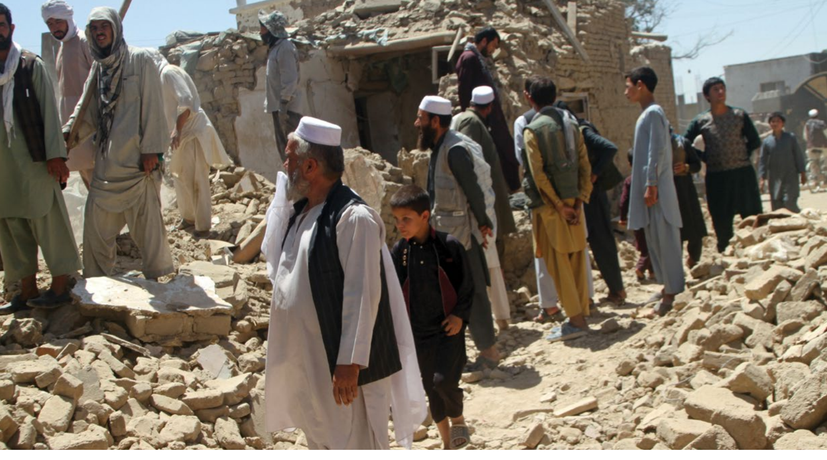
Afghan men stand near a damaged house following a Taliban attack in Ghazni Province on August 15, 2018. A Taliban assault on two adjacent check-points in northern Afghanistan killed at least thirty soldiers and police.