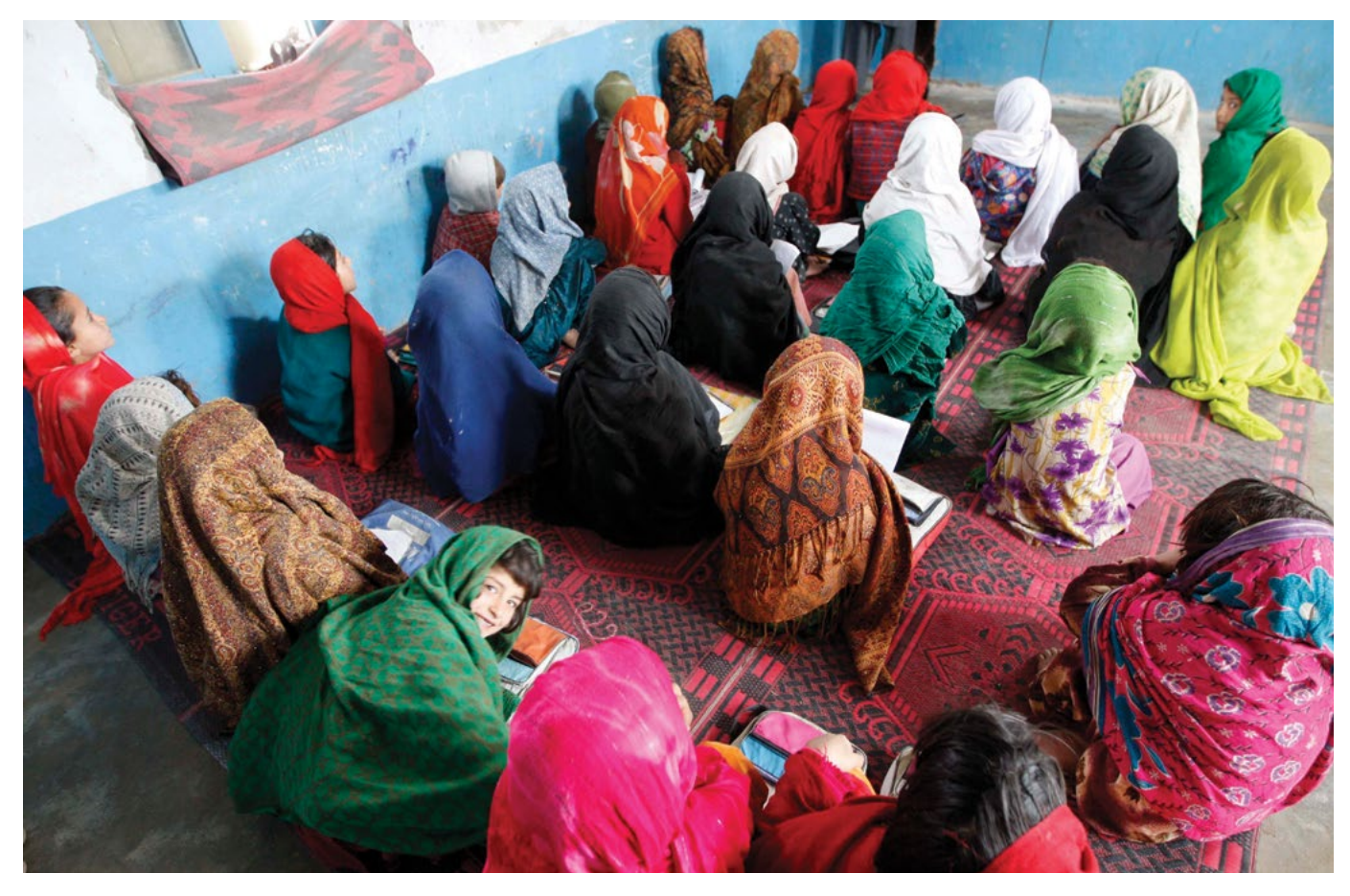
Afghan girls attend a lesson at a school in Sarkani district, in eastern Afghanistan's Kunar Province, in February 2009.

Attacks on schools appear to increase substantially around 2006–7 in line with a marked upsurge in Taliban violence overall.<sup>27</sup> Girls' schools were targeted more frequently than boys'.<sup>28</sup> Female education is generally more controversial than male education, and thus attacks on girls' schools might have been more likely to be tolerated by civilians. Targeting education was also a far lower priority for the Taliban in the beginning, especially in the east and southeast, than international and Afghan forces. Education, however, may have been a more achievable, second-best target. Schools would have been the only government presence in more remote villages, making them convenient objects of Taliban violence aimed at diminishing state presence.<sup>29</sup>